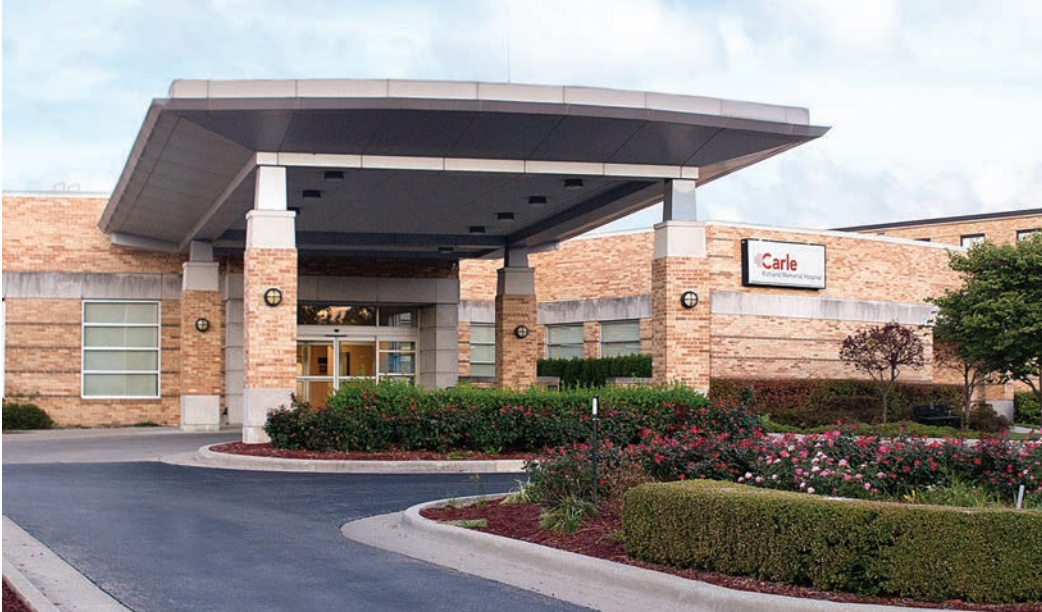
Carle Richland Memorial Hospital