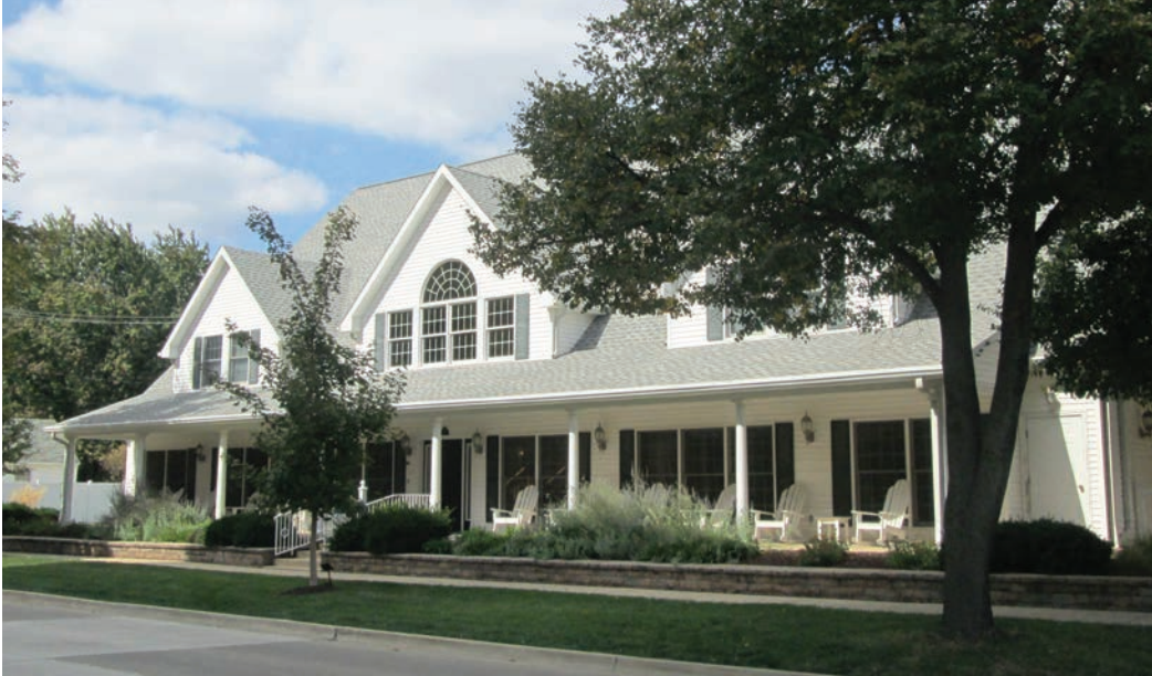
Carle Auxiliary Guest House