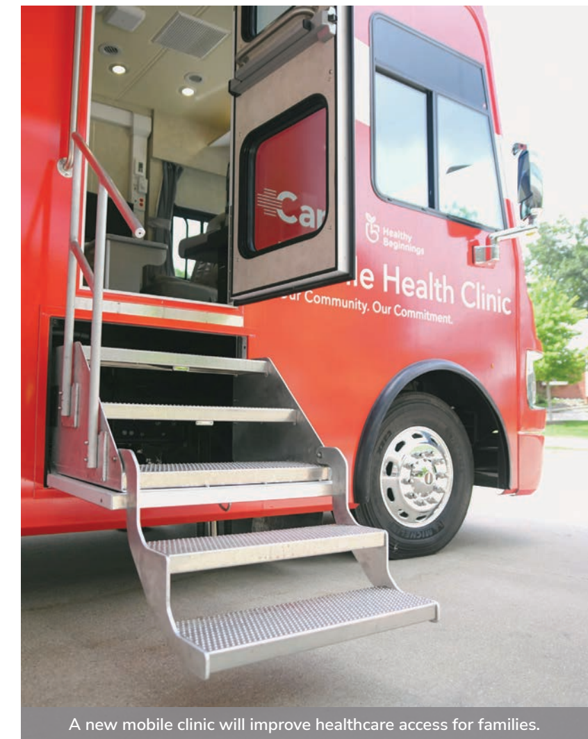
A new mobile clinic will improve healthcare access for families.

For families without a car, there's no such thing as a quick trip to the doctor's office. One appointment could mean multiple bus stops – and possibly a day off work, which could spell disaster for those in a tight spot. Since 2018, the Carle Mobile Health Clinic has helped change that, bringing assessments, screenings, vaccines and other medical necessities to communities throughout Champaign County and beyond. And now, it's being joined by a brand-new Mobile Health Clinic that will serve a nearby county. In 2022, the Tinervin Family Foundation, United Way of McLean County and the City of Bloomington each contributed $150,000 to help purchase a new clinic for McLean County along with help from the Town of Normal, McLean County and Laborers International Union of North America, who each generously donated $100,000. Their generosity helped fund a new, 40-foot mobile clinic that will begin serving Bloomington-Normal area families this spring.