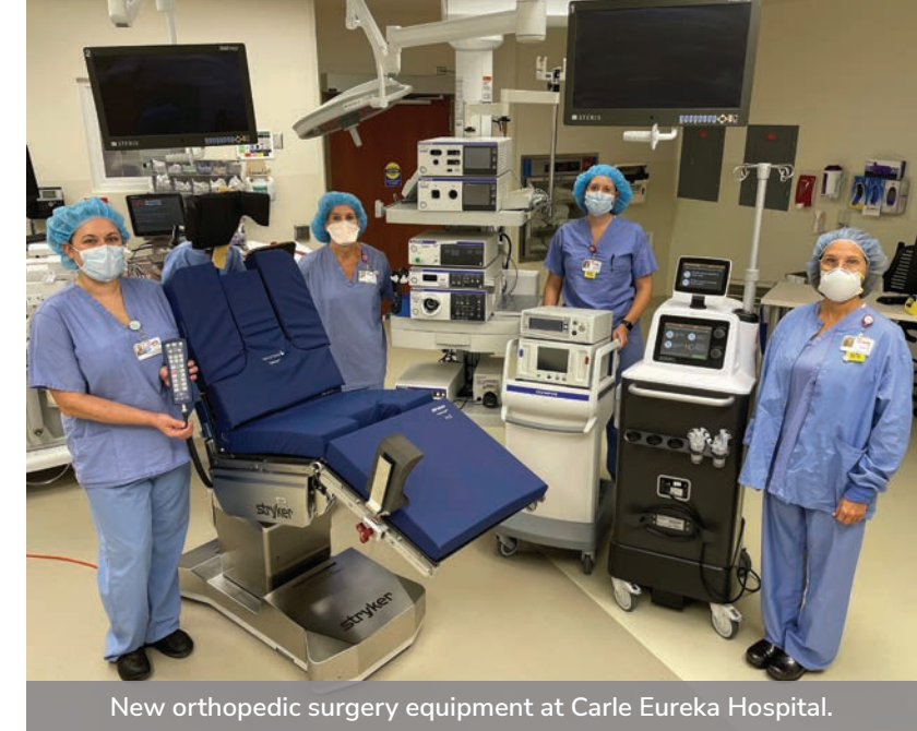
New orthopedic surgery equipment at Carle Eureka Hospital.