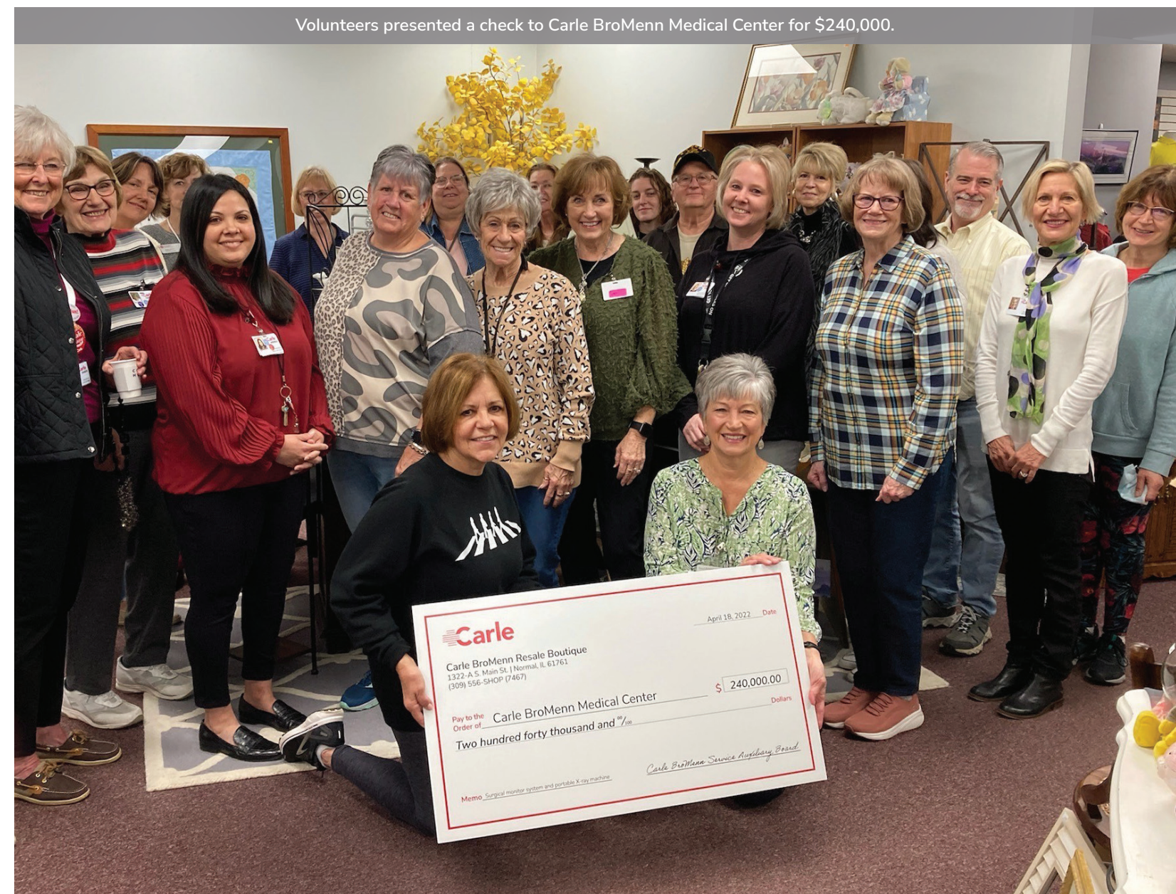
Volunteers presented a check to Carle BroMenn Medical Center for $240,000.

Jingle Jam and the Service Auxiliary Holiday Brunch – crushed the boutique's totals from last year, and November marked the store's biggest month ever, setting records for both the best month and best one-day sales total. The previous monthly record was set in December 2021, when the store raked in $75,300. But in November, they zoomed past that, earning $89,150. All total, the boutique grossed $743,587 in 2022, which will soon make its way into projects that enhance patient care. In April, the Carle BroMenn Service Auxiliary put the proceeds from 2021 to work in the operating room, contributing $240,000 to buy a new surgical monitor system and portable C-arm X-ray machine that provides amazing image quality while limiting the need to move patients. With the record funds raised in 2022, we can't wait to see what the Auxiliary will do next.