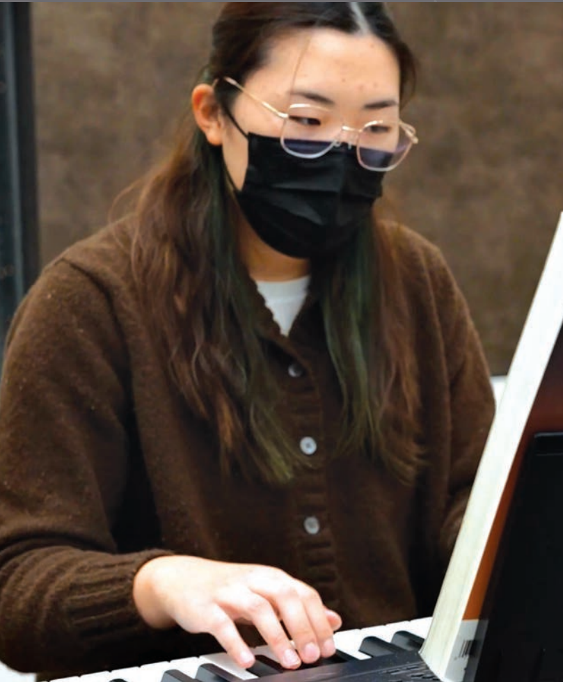
A student volunteer plays piano at the North Star Café.