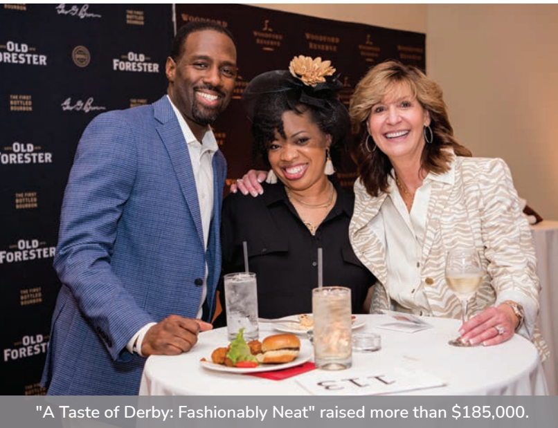
"A Taste of Derby: Fashionably Neat" raised more than $185,000.

DERBY RAISES $185,000 FOR CARLE BROMENN MOTHER BABY UNIT.