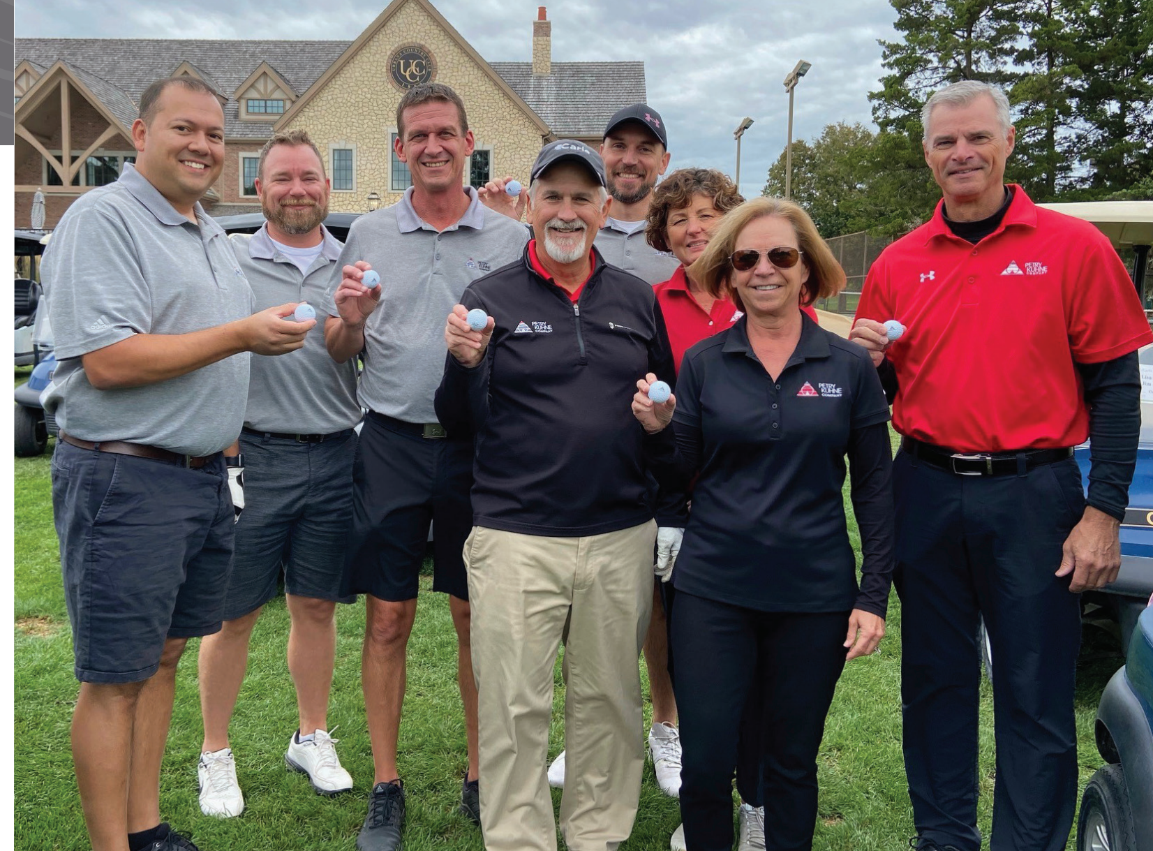
The 2022 Carle Golf Open raised more than $418,000 to support Community Health Initiatives at Carle.

row, they've awarded the Community Health Initiatives Early Childhood team at Carle a $25,000 grant to support their work. The Early Childhood team seeks to expand educational equity and kindergarten readiness across Champaign County by providing educational program development that includes early childhood education, as well as family educational programming. The program is hands-on and highly customized, with team members assessing the needs of each child and supporting their development through an educational plan that's tailored for each family. The team is very grateful for the grant, which will help cover the cost of family programming, supplies, screenings, curriculum materials and quarterly family engagement events designed to help make parents active partners in their child's learning journey.